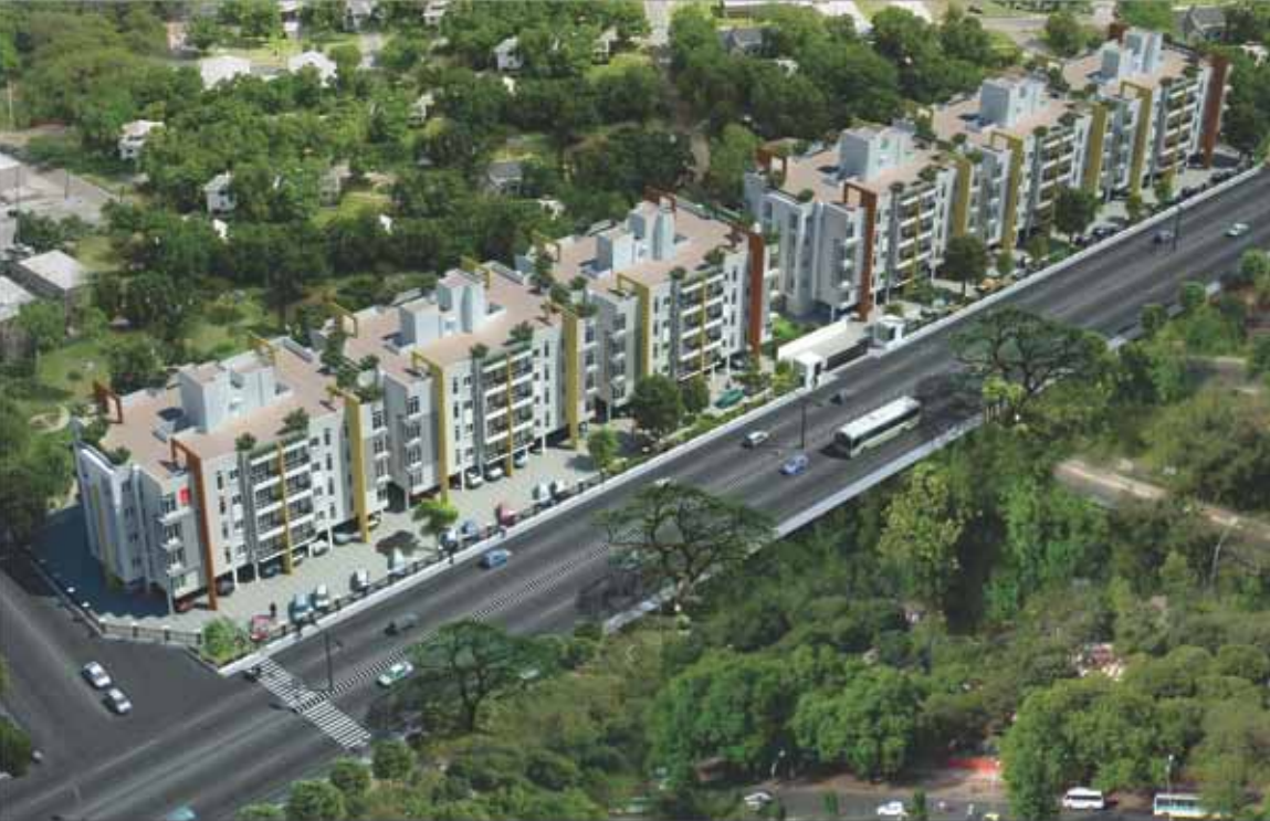
Birds Eye View of Geethanjali