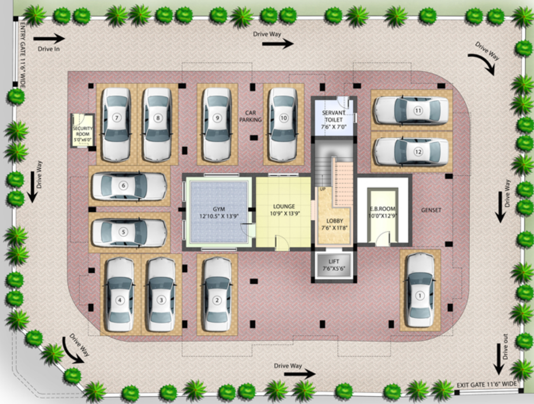
SITE / STILT FLOOR PLAN